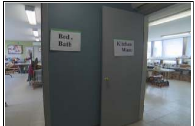
Home Essentials Newcomer Support has multiple rooms with donated items for new immigrants and refugees to choose from.

“It’s much, much worse...they need help” she said.’