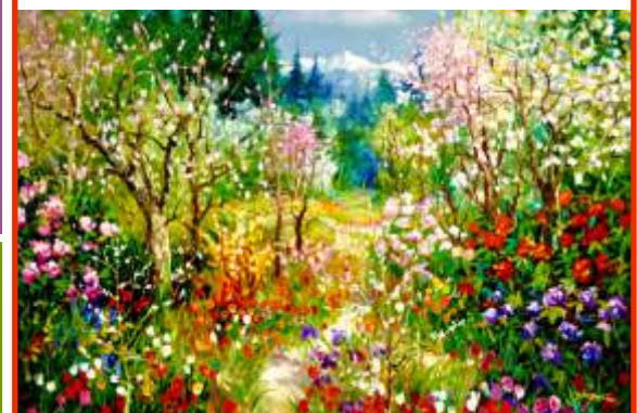
Spring Flowers painting by Vera Kavura

Feel the hot rush of blood as you stroll by passions rising as all seek a mate to love and continue to multiply forming new families to go forth and enjoy all the spring bounties.