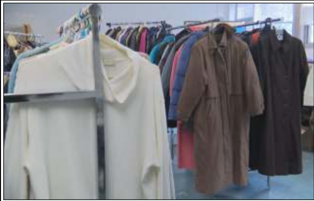
Clothing donations are some of the items HENS offers to newcomers.

The HENS team says most of the families they help are facing similar issues. Out of the 392 families who want their help, 333 reported on their applications that they had children under 18 years old.