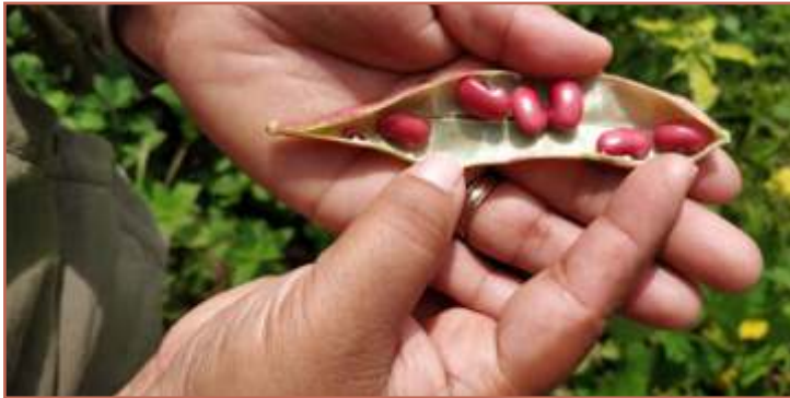
Community members show their pride in a successful bean harvest at the Dora Alicia Sorto School Farm

ADES works closely with the community to grow food in a rural region of El Salvador.